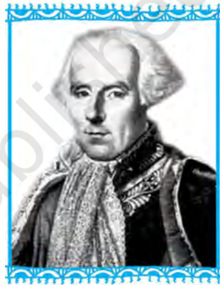
P.S. Laplace (1749-1827)

\frac{a_1}{a_2} \neq \frac{b_1}{b_2} or, a_1 b_2 - a_2 b_1 \neq 0 , then the system of linear equations has a unique solution). The number a_1 b_2 - a_2 b_1